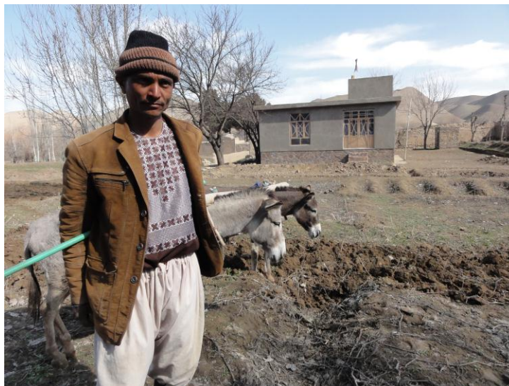
An Afghan farmer participating in a livelihood project.